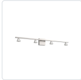
VL19941-BN-UNV Brushed Nickel